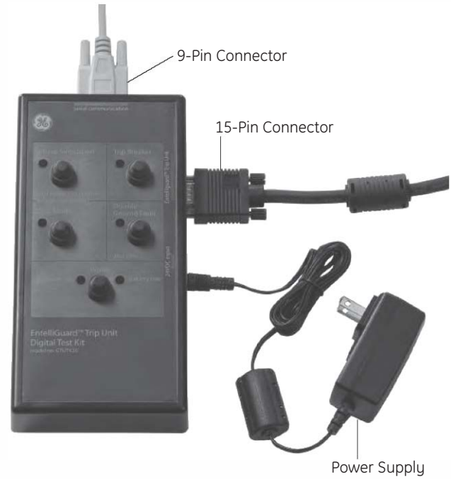
Figure 1. EntelliGuard Test Kit Connections