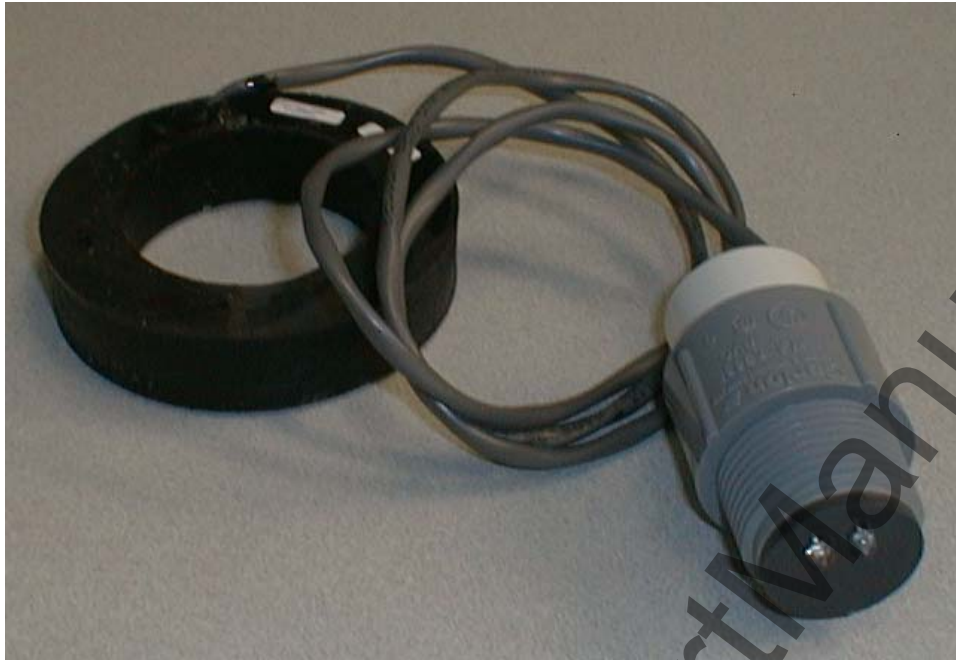
Figure 2 – Fault Indicator (RGFI)