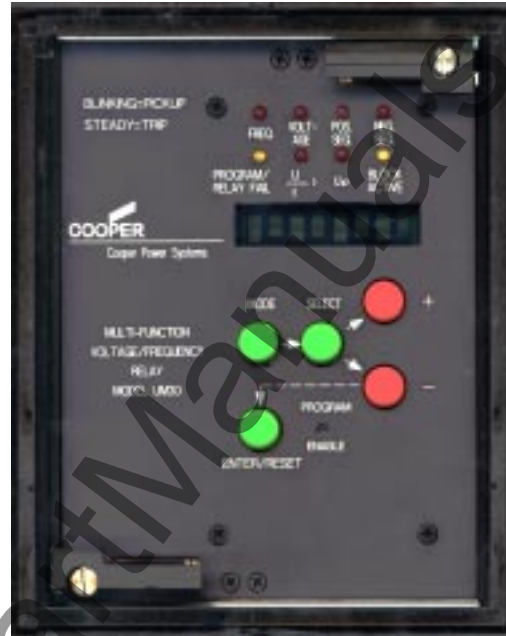
Figure 1. Front View of the UM30 Three-Phase, Frequency and Universal Voltage Relay