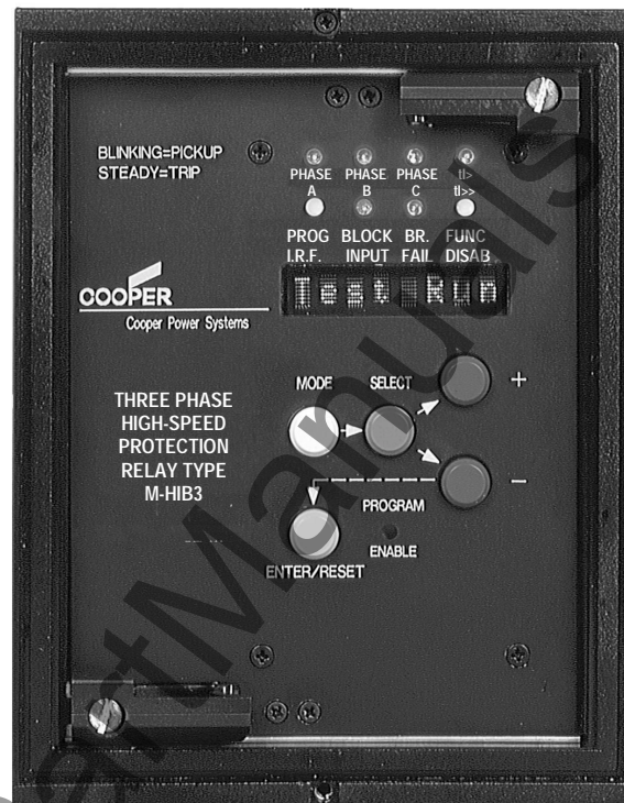
FIGURE 1 Front View of the M-HIB3 High Impedance Biased Differential Relay

Each phase is provided with its own differential element having a characteristic as shown in Figure 2. The relay internally calculates the RMS value of the differential current