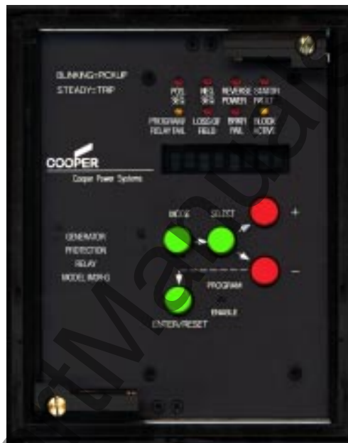
Figure 1. Front View of the IM30G Generator Protection Relay