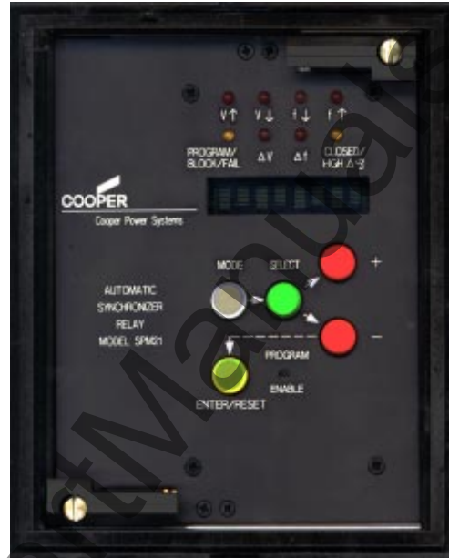
Figure 1. Front View of the SPM21 Synch Check Relay

The SPM21 is for use in bringing a spinning generator into synchronism with the power system. The relay will ensure the generator and bus are within programmable voltage, frequency, and phase angle ranges, then will issue a close signal to the connecting circuit breaker. The breaker closing time is taken into account in this process.