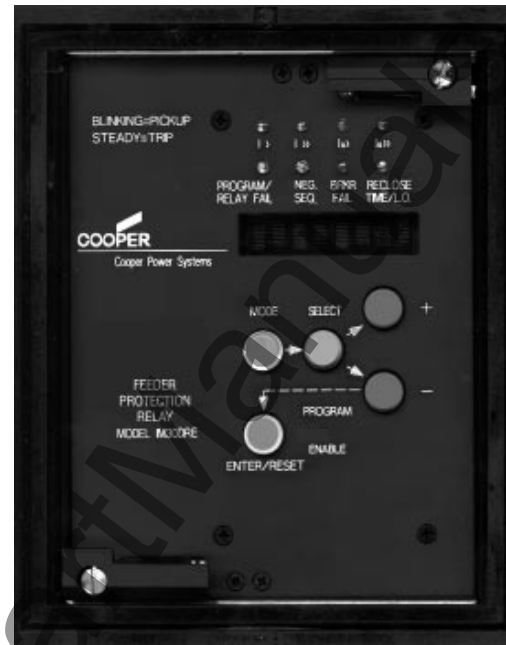
Figure 1. Front View of the IM30DRE Feeder Protection Relay