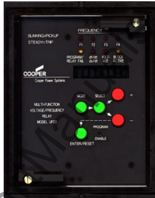
Figure 1. Front View of the UFD3 Load Shed Relay