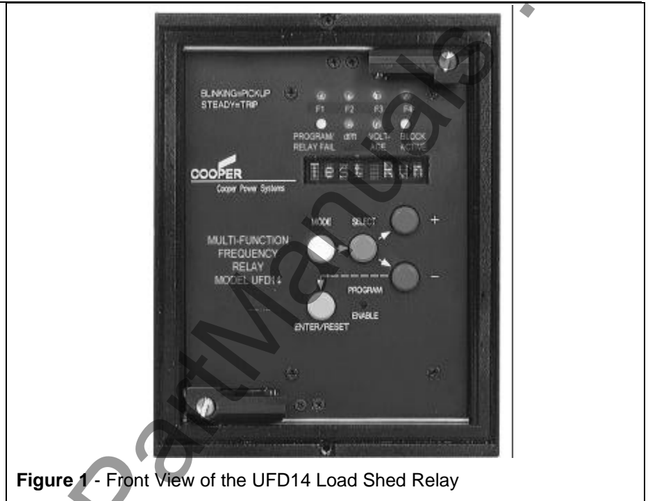
Figure 1 - Front View of the UFD14 Load Shed Relay