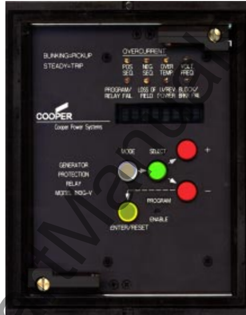
Figure 1. Front View of the IM3GV Generator Protection Relay